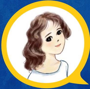
A young Israelite girl