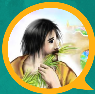
The King Who Was Punished