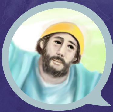
The Man Who Did Not Get Angry